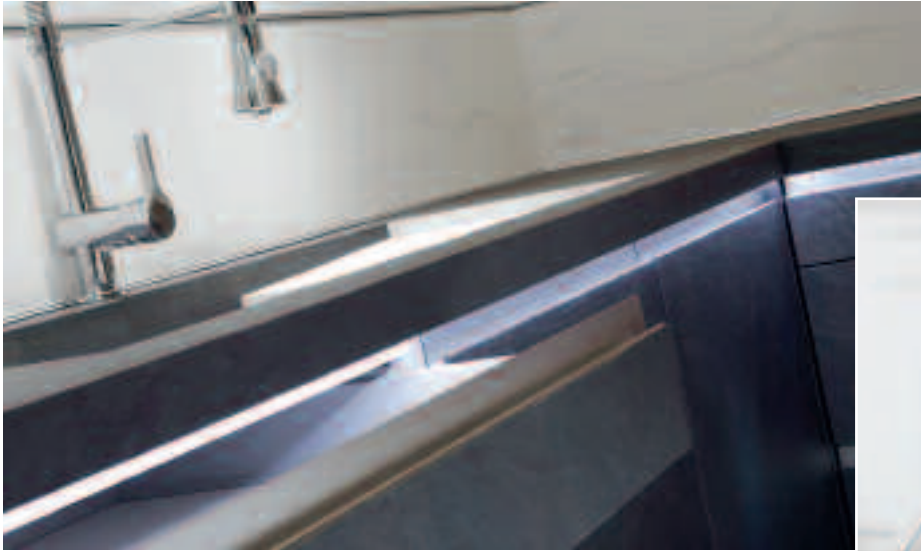
Nano-Stone in the kitchen,